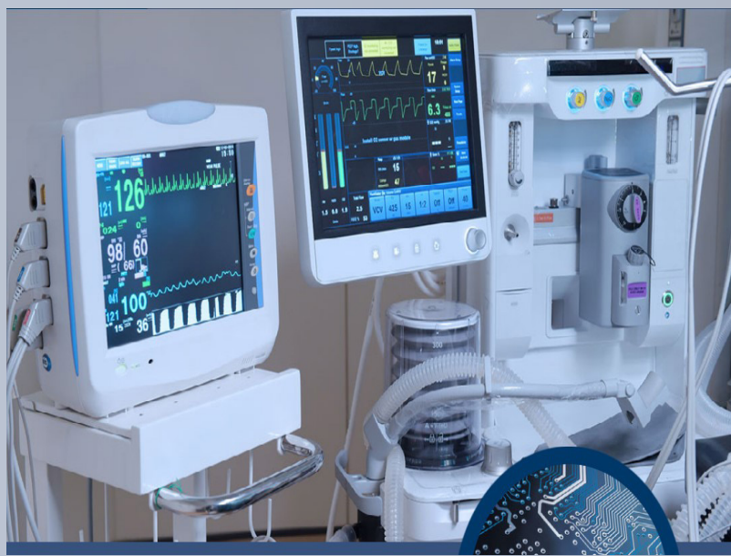
RapiTrim - The Future of Resistor Trimming™